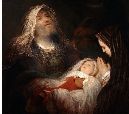
"Simeon's Song of Praise" by Aert de Gelder, 1700-1710 licensed under Creative Commons