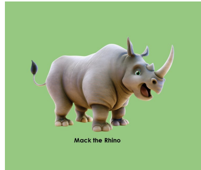
Mack the Rhino

You can watch the video at home anytime and it will be available for a few weeks for your convenience.