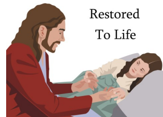
Restored To Life

"Do not fear, only believe," Jesus said to Jairus, who had just received news of his daughter's death. But Jesus didn't say, "Just believe" and then walk away, leaving Jairus alone. Jesus proceeded to gather