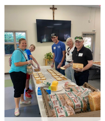
Brown Bag Ministry