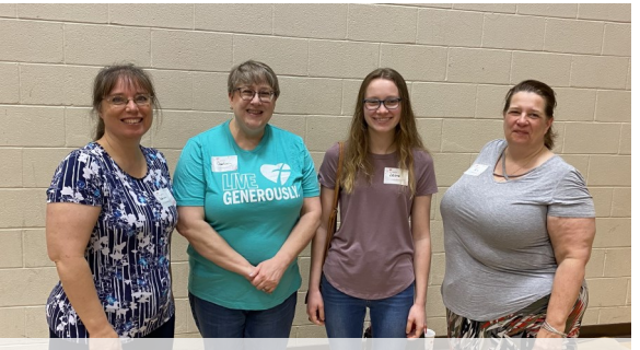
Knitting Hats for Preemies and Cancer Patients at WakeMed