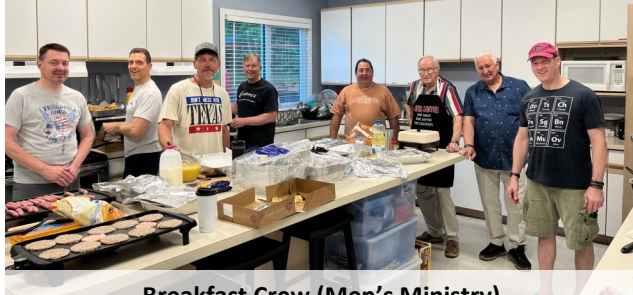
Breakfast Crew (Men's Ministry)

Projects included Brown Bag Ministry, Habitat for Humanity, Camp Agape, Quilters and Sewers for Lutheran World Relief and Sleep in Heavenly Peace, Western Wake Crisis Ministry, Families Together PLM, Cards for 88 LCMS Missionaries and RLC Members, Crafts and Favors for Transitions/Hospice and RLC Members, Christian Library International Prison Alliance, 58 Lutheran World Relief School Kits, and Knitting Hats for Preemies and Cancer Patients at WakeMed (204 baby hats collected throughout the year). What a great day of serving!