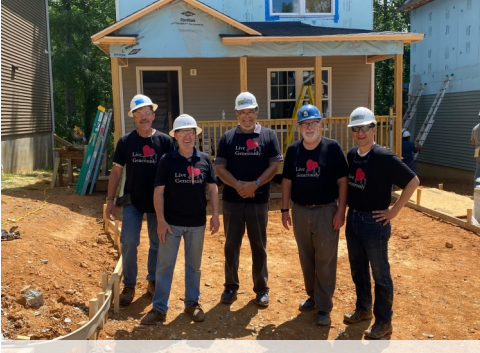
Habitat for Humanity