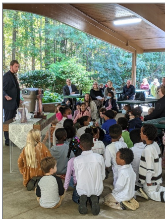
Joint Service with Ethiopian churches in Ritter Park, October 2021