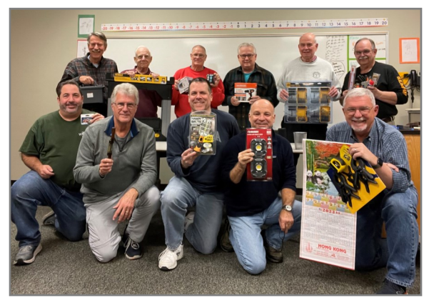
2022 Men's Ministry Tool Gift Exchange

Men's Weekly will resume on Monday, January 30 from 7:00-8:15 pm in Room 240, Family Life Center. Contact mens-ministry@rlcary.org.