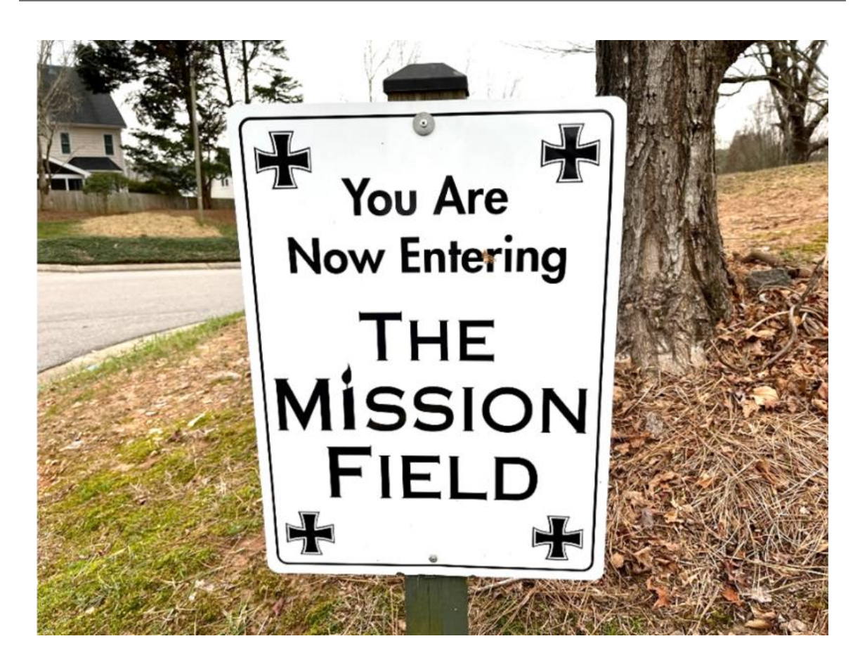
Pastor's Corner for January 15-21